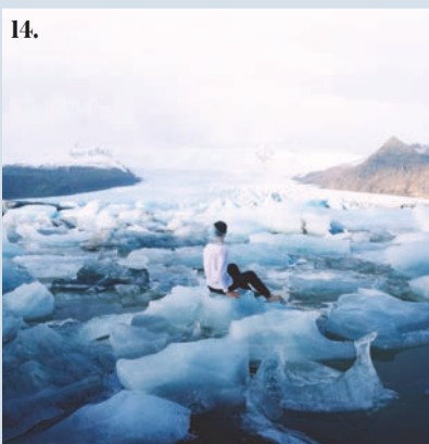
1. Zhenya © Alexander Yantushev. 2. Waste Not Want Not © Simone Steenberg. 3. Untitled © Cooper Ye. 4. Lithe gaze © Kenta Nakamura. 5. Underneath Which Rivers Flow © Dagmar van Weeghel. 6. Between you and me © David PD Hyde. 7. Blue Slide © Alex Currie. 8. Wind of Change © Bobby Buddy. 9. Excessive land © Greta Casagrande. 10. It isn't the mountain ahead that wears you out: It's the grain of sand in your shoes © Sussi C Alminde. 11. Elementary © Korbinian Vogt. 12. Wash My Soul © Zara Wildmoons. 13. Gaea © Anna Belial. 14. Interstellar / Awoken © Simon McCheung.